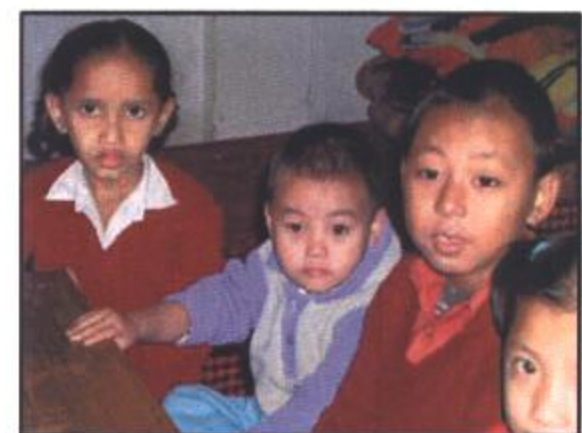
Children in Indian Orphanage

orphanages, and medical care. There are 260 million Indians living on less than $1.00 per day.