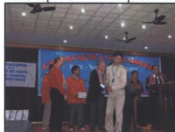
Pastors receiving their OT commentaries from HOHI