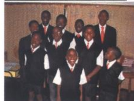
SIHG kids proudly wear school uniforms

The SIHG children are being educated and have been provided new school uniforms. These are some of them.